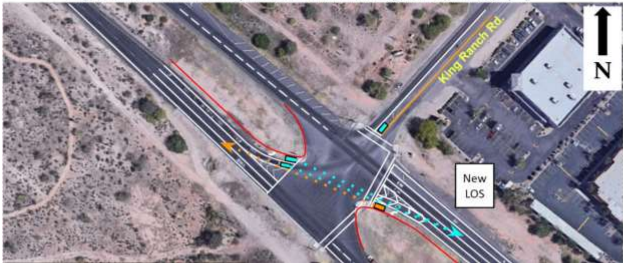
Kings Ranch Rd intersection concept level dual left turn lane design with alternative striping